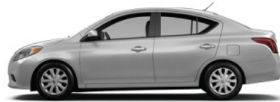
1.6 SV: A WHOLE NEW LEVEL OF COMFORT AND CONVENIENCE