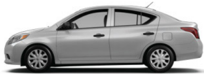
1.6 S: "STARTING AT" WAS NEVER BETTER EQUIPPED