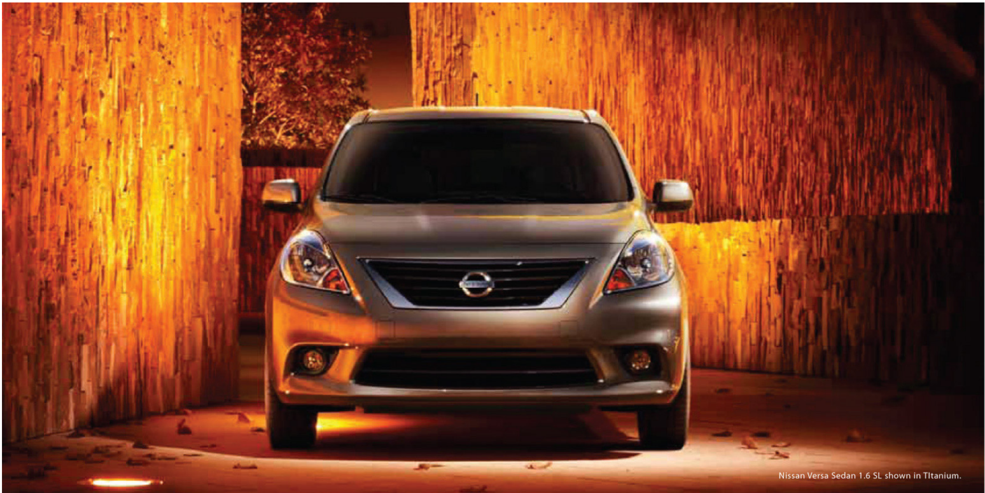
Nissan Versa Sedan 1.6 SL shown in Titanium.